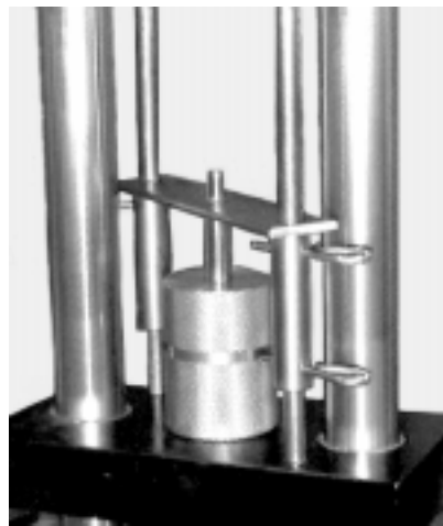
The ET-1-H jacket trim punch is shown in position at the bottom of the stroke.

The exact length of trimmed jacket can be set by the depth gage, provided with the ET-1-H trimmer die. The threaded bushing in the top of the die sets the trimmed length. By setting the length of the rod