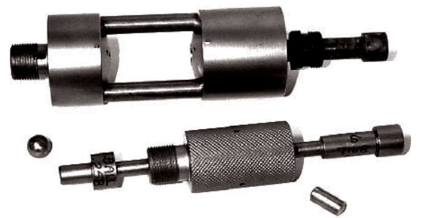
The two dies of the Corbin Ball Swage Kit